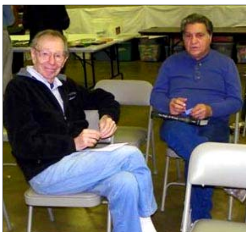
We don't buy magic any more