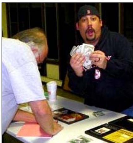
I can't believe I sold something