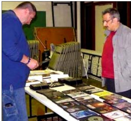
I hope he has money