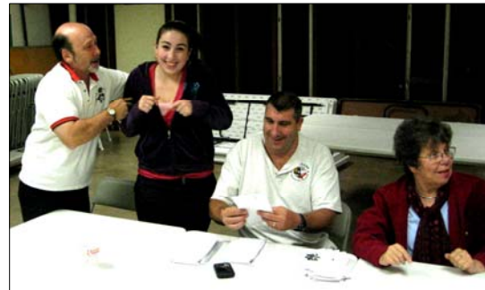
Tom's daughter is camera shy