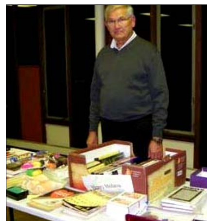
Make me an offer so I can go home

Over heard at the flea mart - Did you hear about the guy whose whole left side was cut off? He's all right now. -who at the flea mart was giving out dead batteries free of charge?