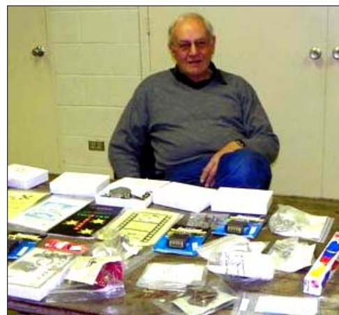
Where are all the customers