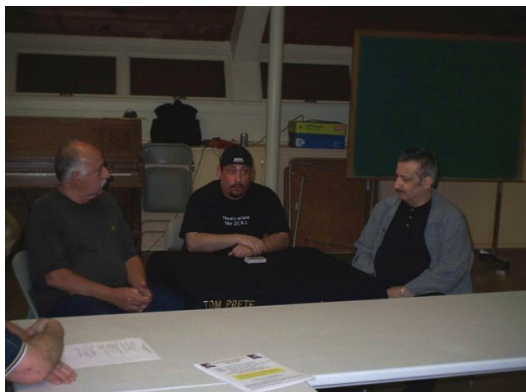
Chick explains why he hates card tricks